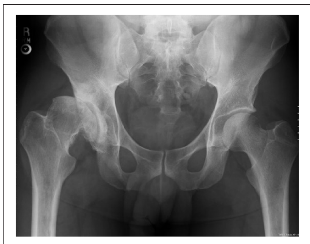
Figure 2a. This anteroposterior (AP) pelvis radiograph shows a 33-year-old man with severe right hip osteoarthritis and dysplasia.

there have been some instances of serious tissue damage due adverse reactions to metal wear debris, particularly in small-size components. 15–18 The more wear-resistant highly cross-linked polyethylenes (XLPE) that have benefitted THR can now be applied to resurfacing. 19–21 Highly cross-linked polyethylene acetabular liners can be made in dimensions suitable for resurfacing. 22,26–28