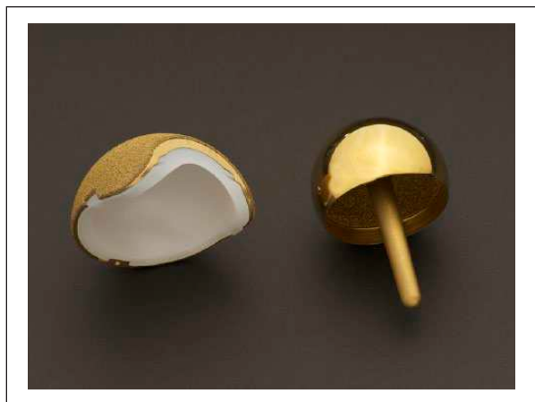
Figure 1. The resurfacing implants used were two-piece acetabular components, consisting of a porous titanium shell and an XLPE liner. The femoral component is TiN-coated titanium.