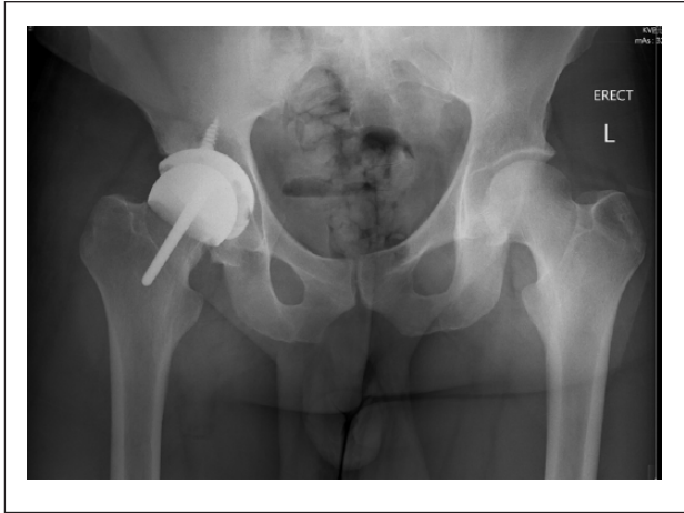
Figure 2b. The postoperative radiograph shows the resurfaced hip, using a two-piece acetabular component with an XLPE component and a cementless porous coated TiN-coated titanium femoral component.

Each femoral component fits with a specific matching (300 \mu\text{m} radial clearance) acetabular bearing and each acetabular bearing fits a specific acetabular shell. The acetabular component is designed to be placed at 30–45° of inclination and from 0° to 25° of anteversion. The goal for combined femoral and acetabular anteversion is a maximum of 45°. The femoral stem was placed from neutral to 15° of valgus relative to the native femoral neck. The thin flexible acetabular shell is placed with under-reaming of the acetabular bone. Typically, the components can be placed with a 9 mm or 10 mm differential between the acetabular and femoral preparation compared to 6 mm with MoM. 1,9 The shell, XLPE, and locking mechanism are tolerant of deformation allowing better acetabular bone preservation. This assembly provides a several-millimeter benefit in acetabular bone conservation over predicate polyethylene implants. 4,5,13,14,26–28